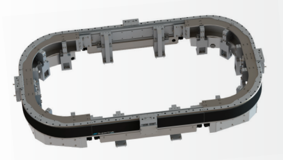
SuperTrak GEN3™ 90-degree Configuration